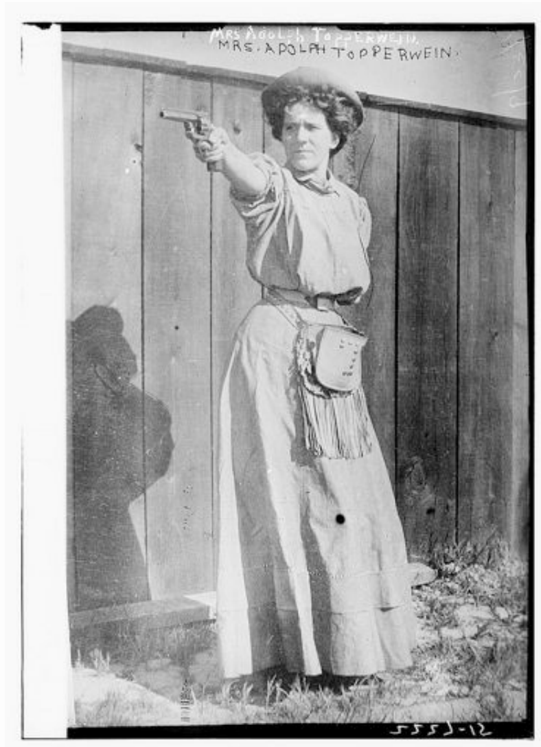
“I said, Dance!”